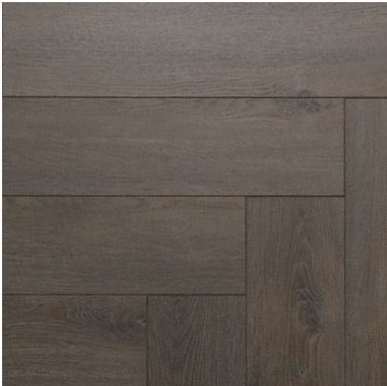
ARONIA OAK 542, AC 6 640MM X 143MM X 12MM HERRINGBONE ALSA HERRINGBONE COLLECTION