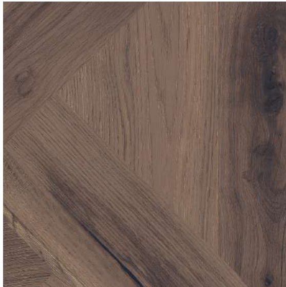
OAK MILANO VITTORIO K2588, AC 5 1290MM X 329MM X 8MM PLANK AQUAPRO COLLECTION