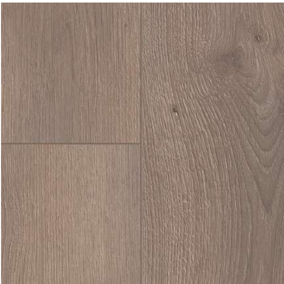
OAK PLENO K4350, AC 4 1383MM X 193MM X 8MM PLANK STANDARD PLANK COLLECTION