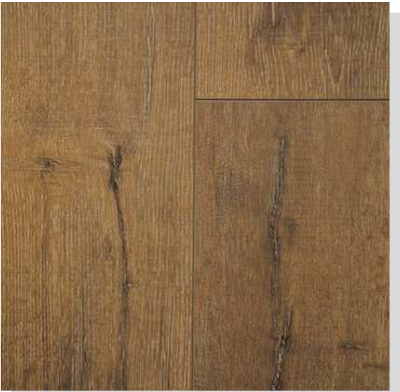
NATURAL SAPPHIRE R-473, AC 4 1215MM X 193MM X 12MM PLANK SAPPHIRE COLLECTION