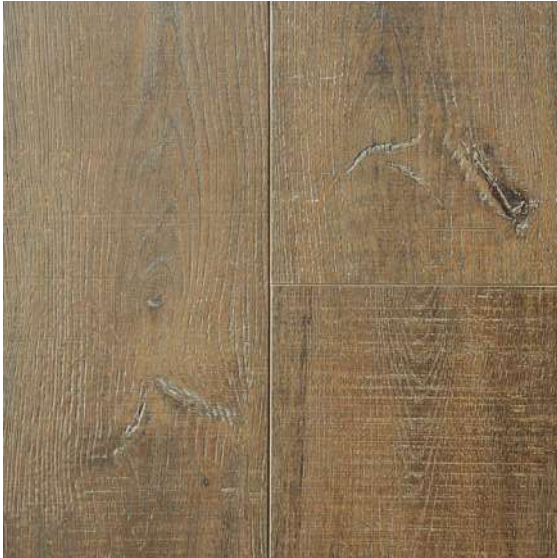
VERANO CLASSICA R-395, AC 4 1215MM X 193MM X 12MM PLANK CLASSICA COLLECTION