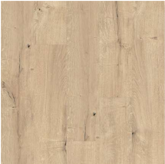
OAK ZERMATT CASTOR K2413, AC 5 1383MM X 193MM X 8.5MM PLANK FLOORORGANIC COLLECTION