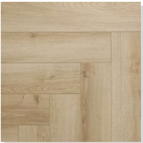
JEFFERSON 435, AC 6 640MM X 143MM X 12MM HERRINGBONE ALSA HERRINGBONE COLLECTION