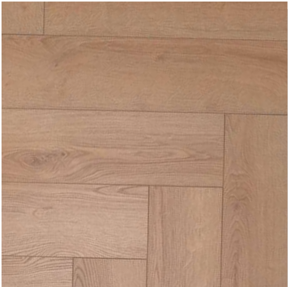
SUNSET 471W, AC 6 644MM X 143MM X 12MM HERRINGBONE ALSA HERRINGBONE COLLECTION