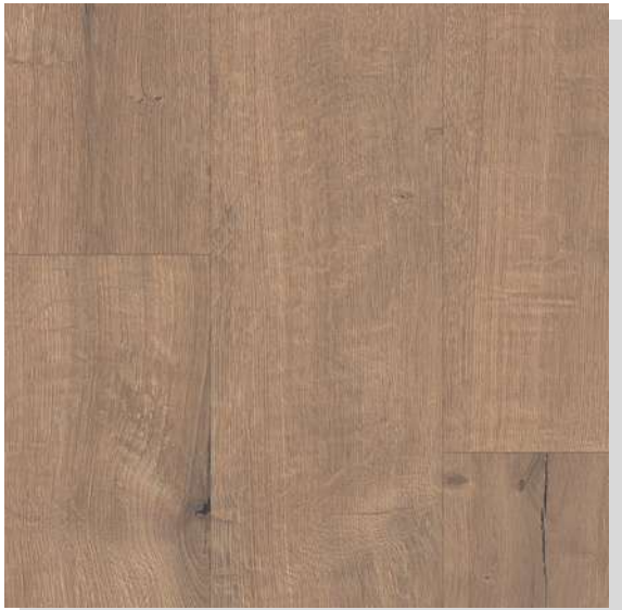
OAK ZERMATT LISKAMM K2415, AC 5 1383MM X 193MM X 8.5MM PLANK FLOORORGANIC COLLECTION