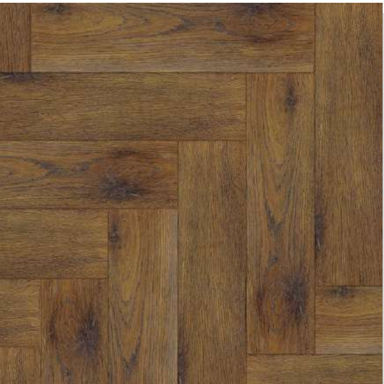
CHESTNUT OAK 528W 644MM X 143MM X 12MM HERRINGBONE ALSA HERRINGBONE COLLECTION