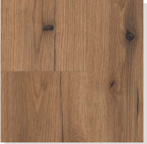
OAK EVOKE SUNSET K5574, AC 5 1383MM X 193MM X 8MM PLANK AQUAPRO COLLECTION