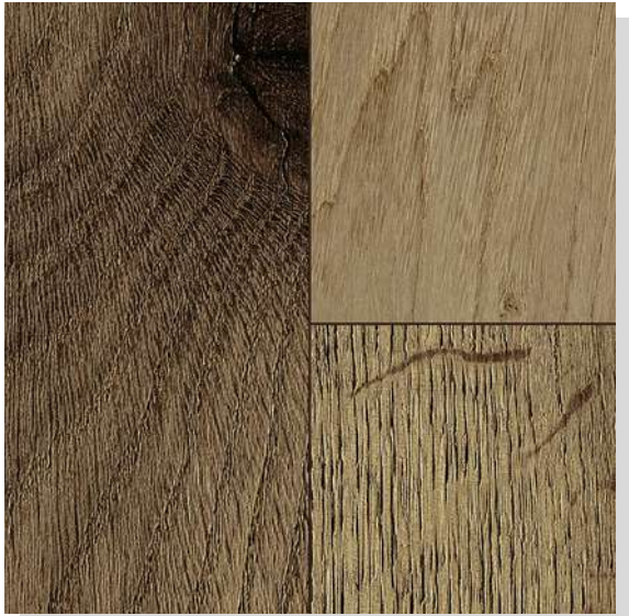
OAK FARCO ELEGANCE K-4362 OAK, AC 4 1383MM X 193MM X 8MM PLANK 3 IN 1 COLLECTION