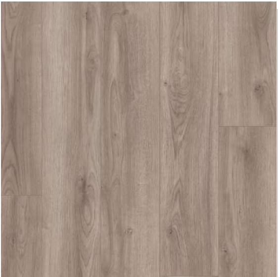
OAK CORDOBA MODERNO K2240, AC 5 1383MM X 193MM X 8MM PLANK AQUAPRO COLLECTION