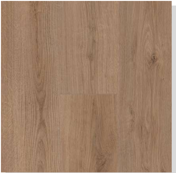
OAK EVOKE TREND K4421, AC 4 1383MM X 193MM X 12MM PLANK AQUAPRO COLLECTION