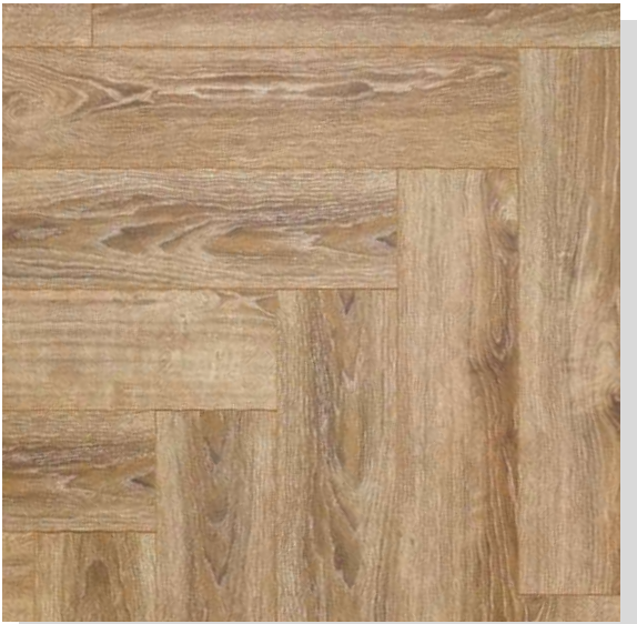
BALEARIC OAK 622, AC 6 640MM X 143MM X 12MM HERRINGBONE ALSA HERRINGBONE COLLECTION