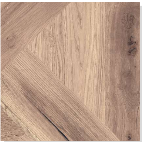
OAK MILANO NINA K2587, AC 5 1290MM X 329MM X 8MM PLANK AQUAPRO COLLECTION