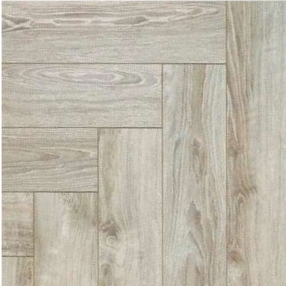
SARDINIA OAK 619, AC 6 640MM X 143MM X 12MM HERRINGBONE ALSA HERRINGBONE COLLECTION