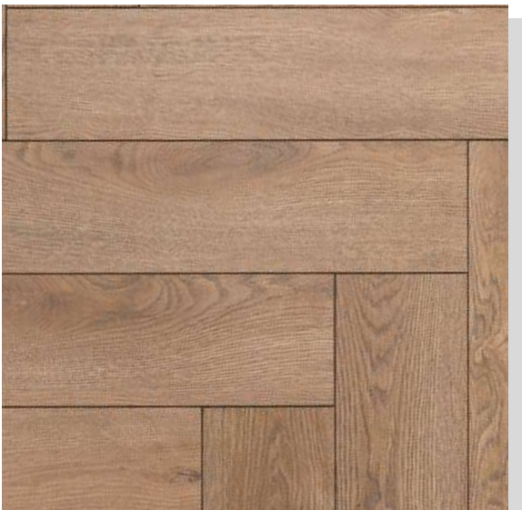
PRALIN OAK 535, AC 6 640MM X 143MM X 12MM HERRINGBONE ALSA HERRINGBONE COLLECTION