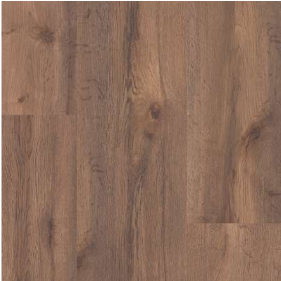
OAK KANSAS WICHITA O921, AC 5 1383MM X 244MM X 8.5MM PLANK FLOORORGANIC COLLECTION