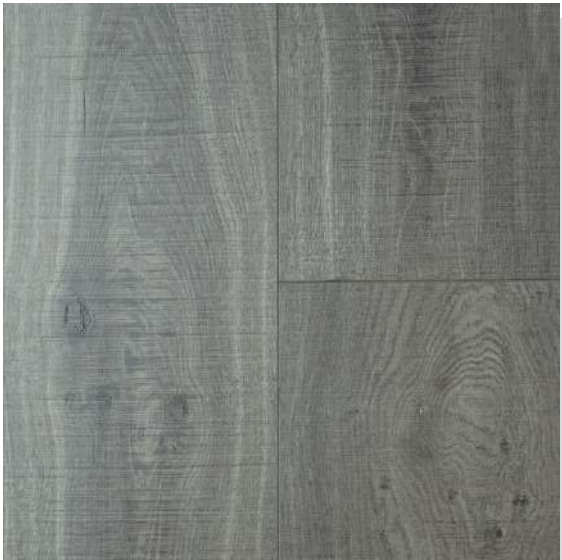
1149 1149, AC 4 1800MM X 238MM X 12MM PLANK ATROGUARD COLLECTION