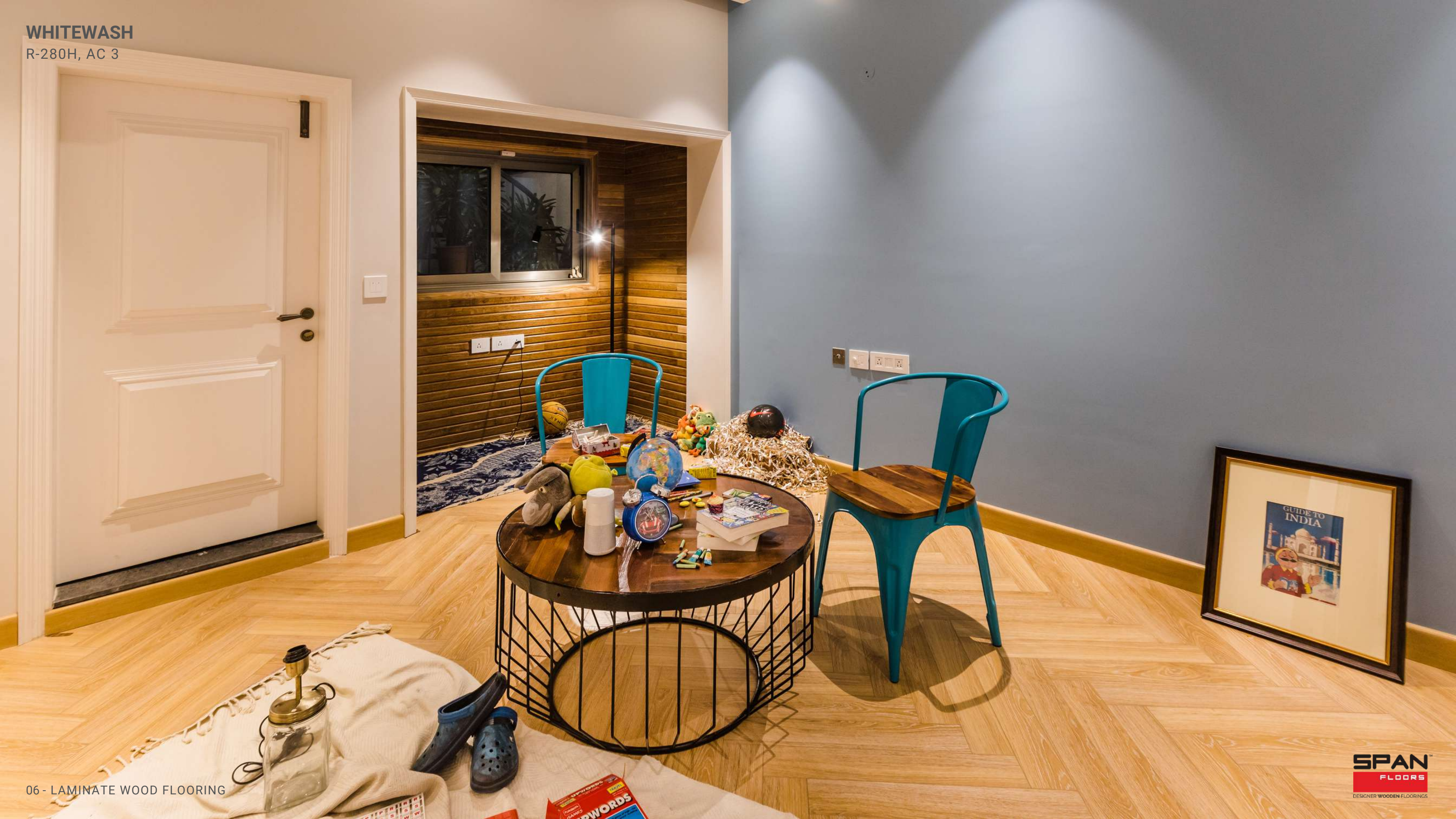
06 - LAMINATE WOOD FLOORING