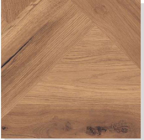
OAK MILANO REALE K2589, AC 5 1290MM X 329MM X 8MM PLANK AQUAPRO COLLECTION