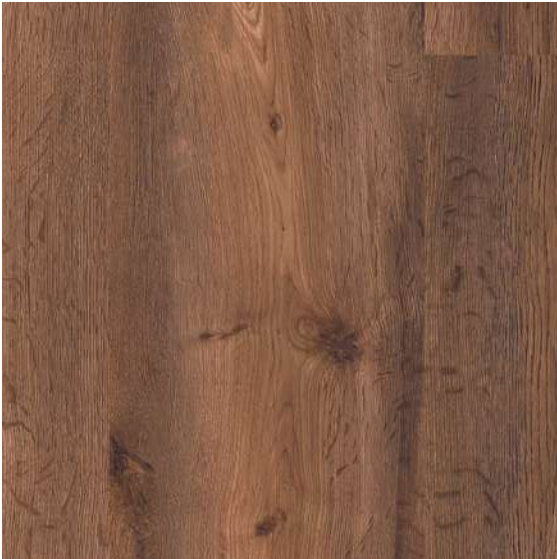
OAK KANSAS OVERLAND O920, AC 5 1383MM X 244MM X 8.5MM PLANK FLOORORGANIC COLLECTION