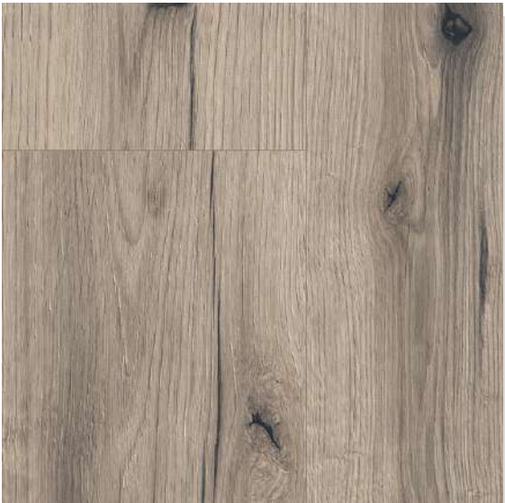
OAK EVOKE SOLANO K5576, AC 5 1383MM X 193MM X 8MM PLANK AQUAPRO COLLECTION