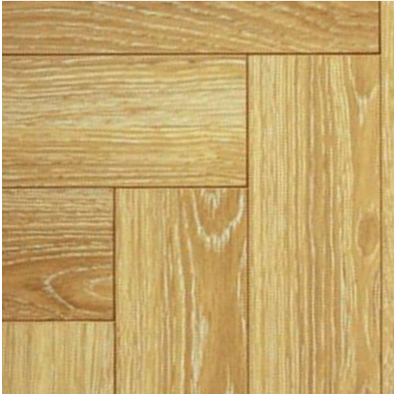
WHITEWASH R-280H, AC 3 600MM X 100MM X 12MM HERRINGBONE HERRINGBONE COLLECTION