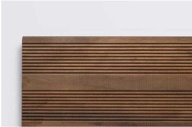
Vulcan Decking – Uncoated