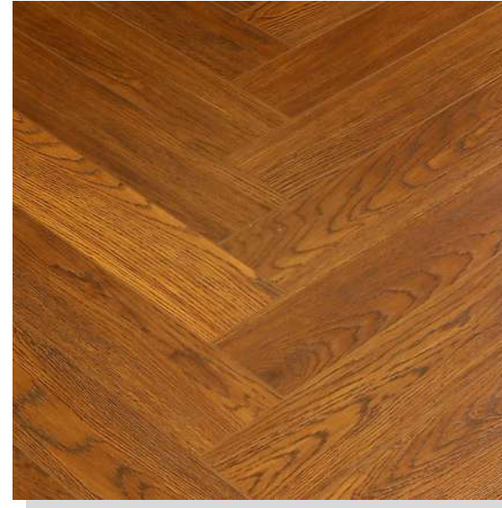
HONEY R-146H, AC 3 600MM X 100MM X 12MM HERRINGBONE HERRINGBONE COLLECTION