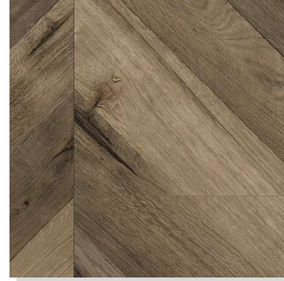
OAK FORTRESS ASHFORD CODE- K 4379 OAK, AC 4 1383MM X 244MM X 8MM CHEVRON FISHBONE COLLECTION