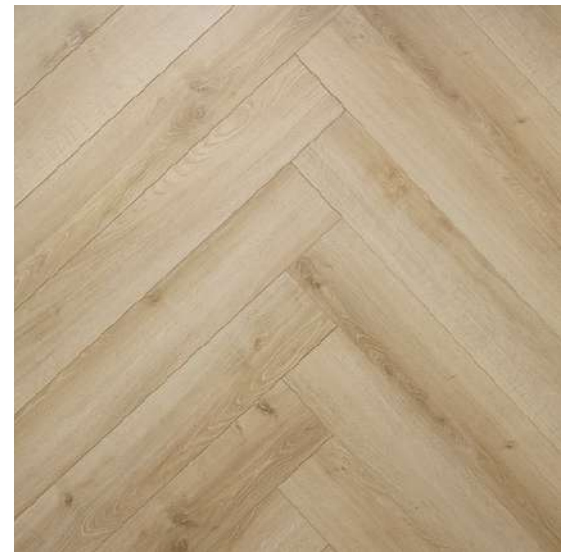
JEFFERSON 435, AC 6 640MM X 143MM X 12MM HERRINGBONE ALSA HERRINGBONE COLLECTION