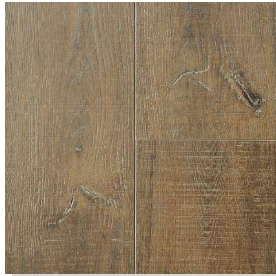
VERANO CLASSICA R-395, AC 4 1215MM X 193MM X 12MM PLANK CLASSICA COLLECTION