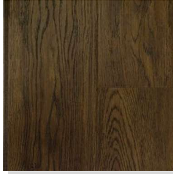
HONEY R-146, AC 4 1213MM X 142MM X 12.3MM PLANK SOHO COLLECTION