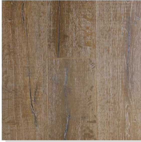
TOFFEE SAPPHIRE R-475, AC 4 1215MM X 193MM X 12MM PLANK SAPPHIRE COLLECTION