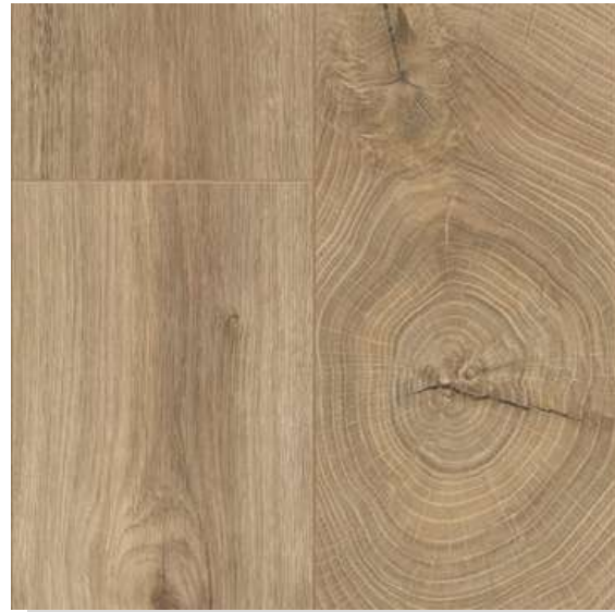
OAK FRESCO LODGE K-4381 OAK, AC 4 1383MM X 159MM X 10MM PLANK PREMIUM COLLECTION