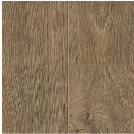
OAK BUFFALO 37267, AC 4 1383MM X 159MM X 10MM PLANK PREMIUM COLLECTION