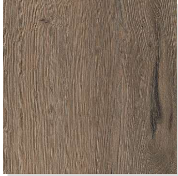
OAK ORLANDO 34242, AC 4 1383MM X 159MM X 10MM PLANK PREMIUM COLLECTION