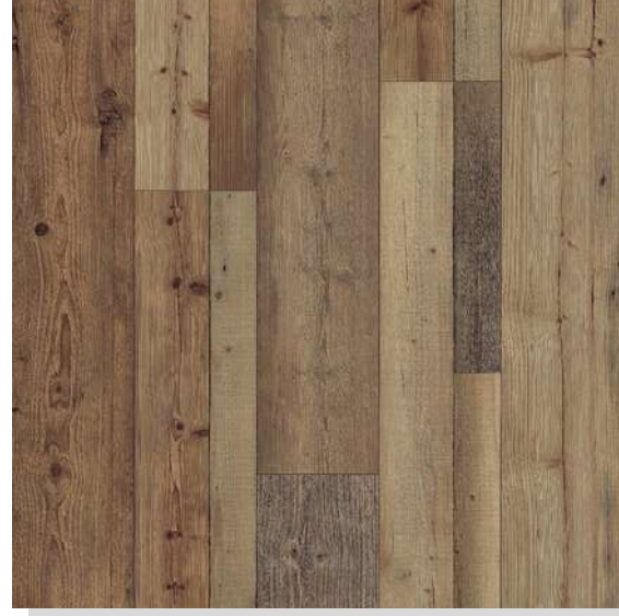
OAK FARCO VIVID K-4366 PINE, AC 4 1383MM X 193MM X 8MM PLANK 3 IN 1 COLLECTION