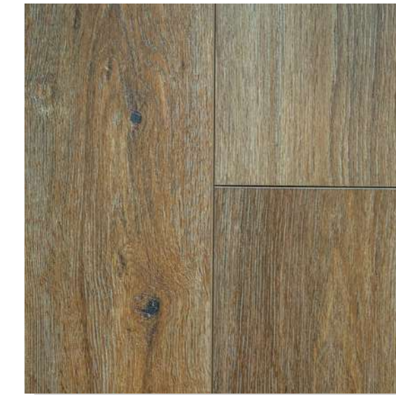
SUNSET RA-11, AC 4 1215MM X 193MM X 12MM PLANK PRAGUE COLLECTION