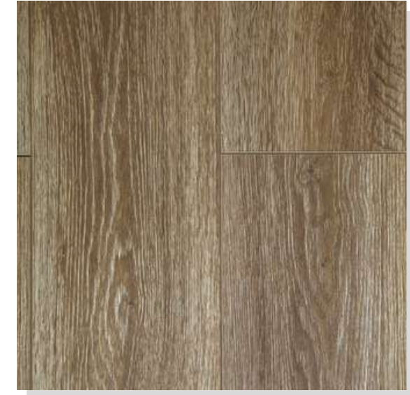
CELLER RA-14, AC 4 1215MM X 193MM X 12MM PLANK PRAGUE COLLECTION