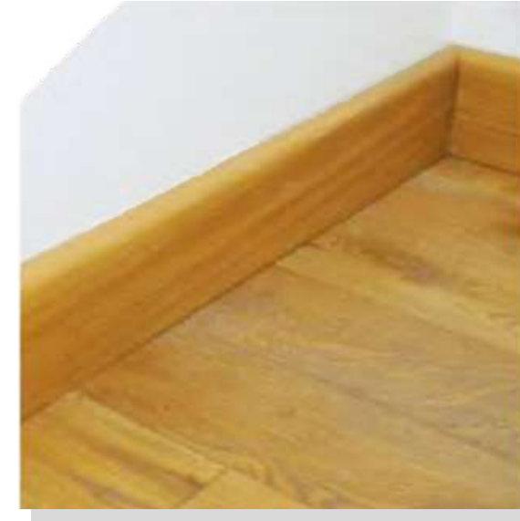
SOLID WOOD SKIRTING