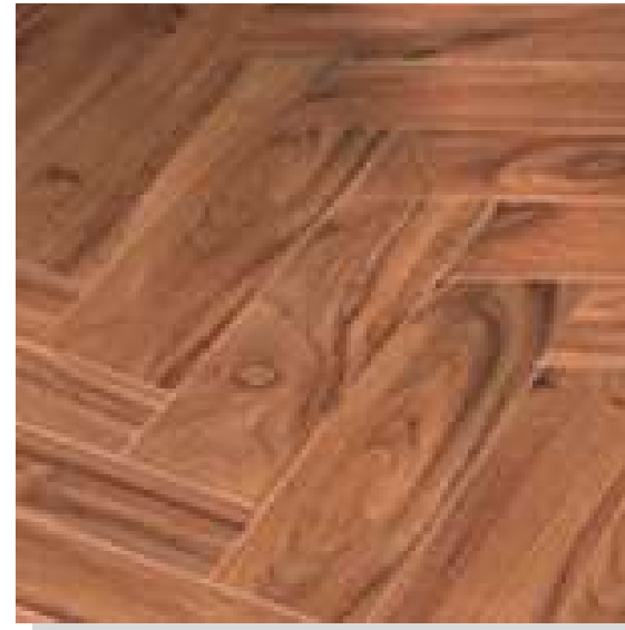
AMERICAN APPLE P-659H, AC 3 600MM X 100MM X 12MM HERRINGBONE HERRINGBONE COLLECTION