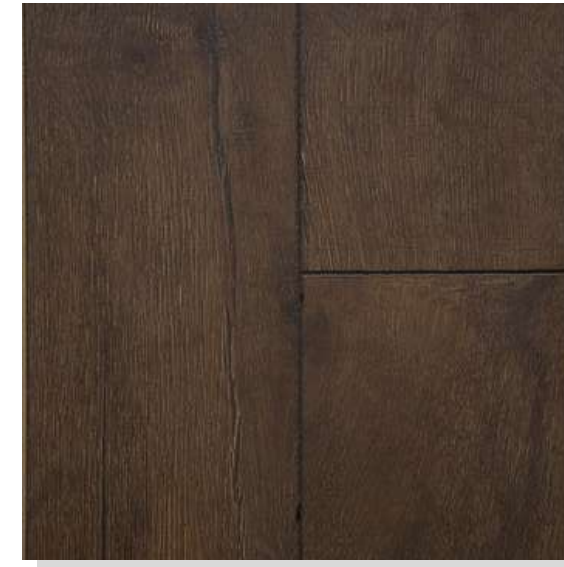
DAKOTA R-765, AC 4 1215MM X 193MM X 12MM PLANK MONTANA COLLECTION