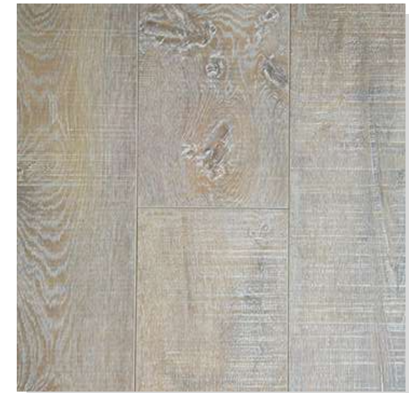
PALERMO CLASSICA R-394, AC 4 1215MM X 193MM X 12MM PLANK CLASSICA COLLECTION