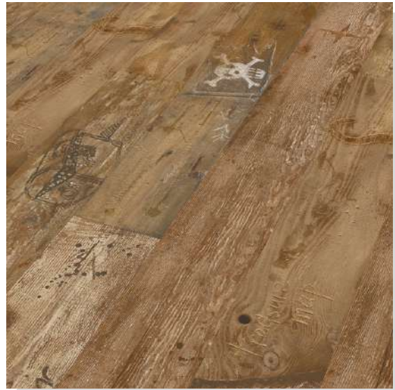
P80150 P80150, AC 4 1383MM X 159 MM X 8MM PLANK CREATIVE COLLECTION