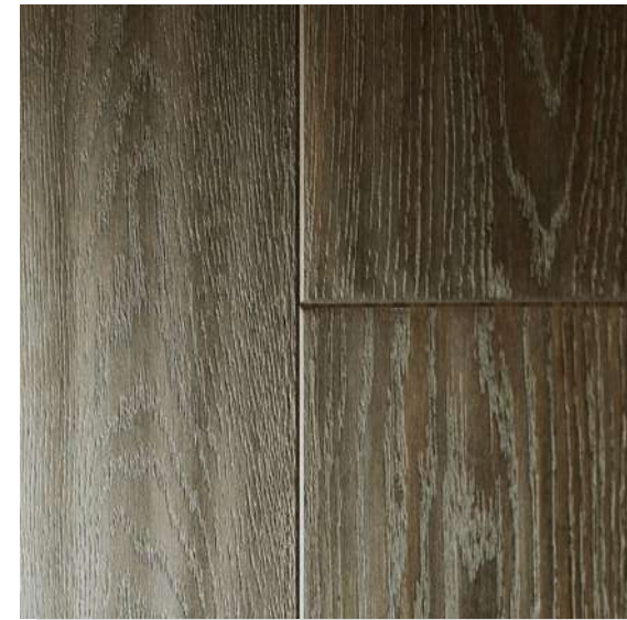
COFFEE OAK R-144, AC 4 1213MM X 142MM X 12.3MM PLANK SOHO COLLECTION