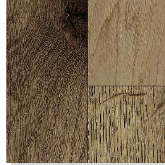
OAK FARCO ELEGANCE K-4362 OAK, AC 4 1383MM X 193MM X 8MM PLANK 3 IN 1 COLLECTION