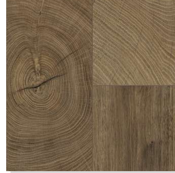
OAK FRESCO BARK K-4382 OAK, AC 4 1383MM X 159MM X 10MM PLANK PREMIUM COLLECTION