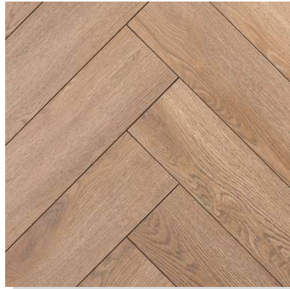
PRALIN OAK 535, AC 6 640MM X 143MM X 12MM HERRINGBONE ALSA HERRINGBONE COLLECTION