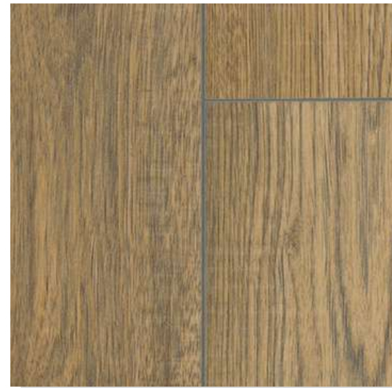
HICKORY CHELSEA 34073, AC 4 1383MM X 159MM X 10MM PLANK PREMIUM COLLECTION