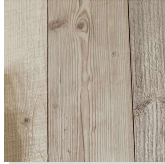
PINE FARCO SPIRIT K-4365 PINE, AC 4 1383MM X 193MM X 8MM PLANK 3 IN 1 COLLECTION