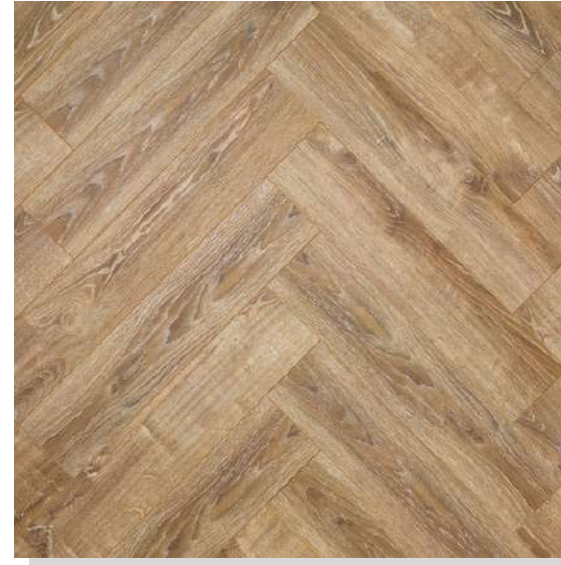
BALEARIC OAK 622, AC 6 640MM X 143MM X 12MM HERRINGBONE ALSA HERRINGBONE COLLECTION