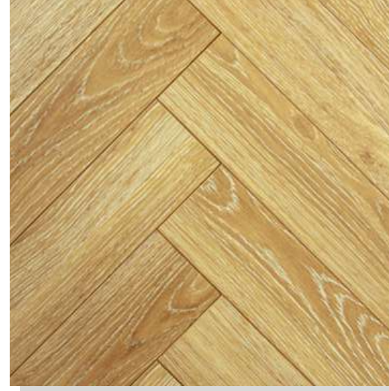
WHITEWASH R-280H, AC 3 600MM X 100MM X 12MM HERRINGBONE HERRINGBONE COLLECTION