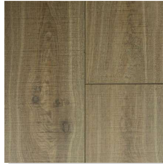
1144 1144, AC 4 1800MM X 238MM X 12MM PLANK ATROGUARD COLLECTION