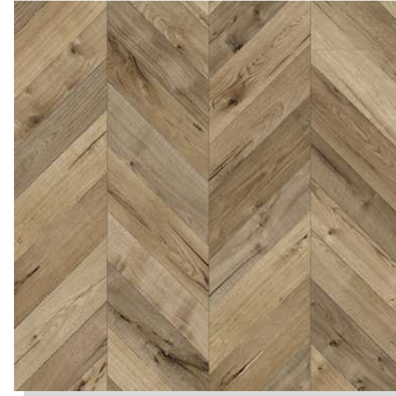
OAK FORTRESS ROCHESTA K 4378 OAK, AC 4 1383MM X 244MM X 8MM CHEVRON FISHBONE COLLECTION