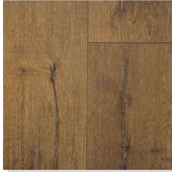
NATURAL SAPPHIRE R-473, AC 4 1215MM X 193MM X 12MM PLANK SAPPHIRE COLLECTION