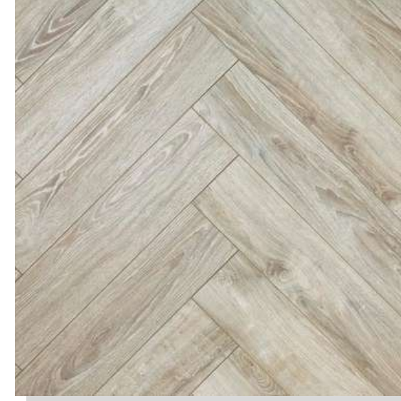
SARDINIA OAK 619, AC 6 640MM X 143MM X 12MM HERRINGBONE ALSA HERRINGBONE COLLECTION