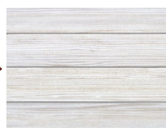
Vulcan Sioo:x Weathered exterior install

We cannot guarantee against wear or color changes to any products which result from weather, sun, wind and/or the natural aging process of the wood.