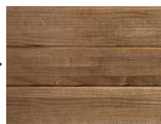
Vulcan Teak Weathered exterior install