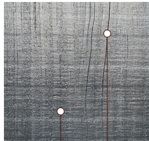
Laminated glue seams | Face check