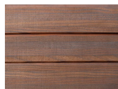
Vulcan Teak As delivered