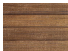
Vulcan Sioo:x As delivered